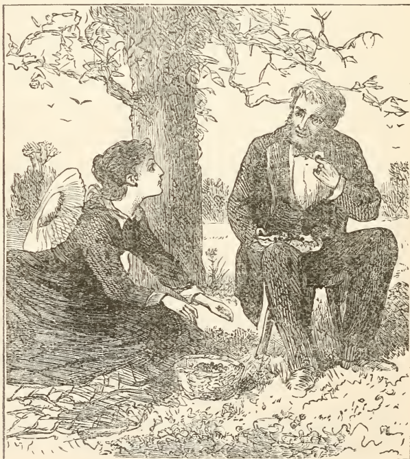
MR. POWER AND CHRISTIE IN THE STRAWBERRY BED.

“This is luxury!” and Mr. Power sat down on the three-legged stool offered him, with a rhubarb leaf on his knee which Christie kept supplying with delicious mouthfuls.